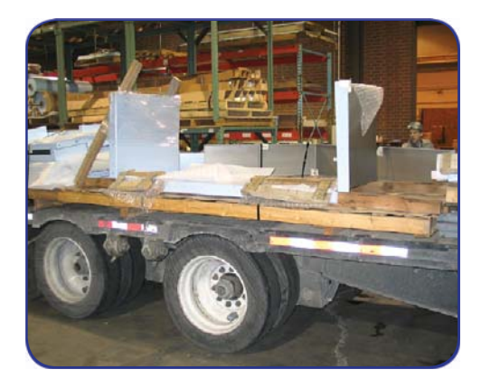
Pool sections are shipped to the project site

Easy to install and virtually maintenance-free, Natare® elevated pools are tailored to each application and installation.