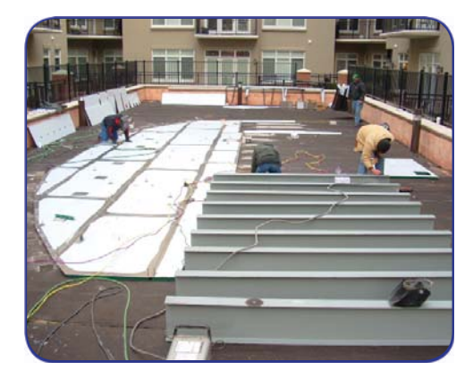
Pool floor under construction