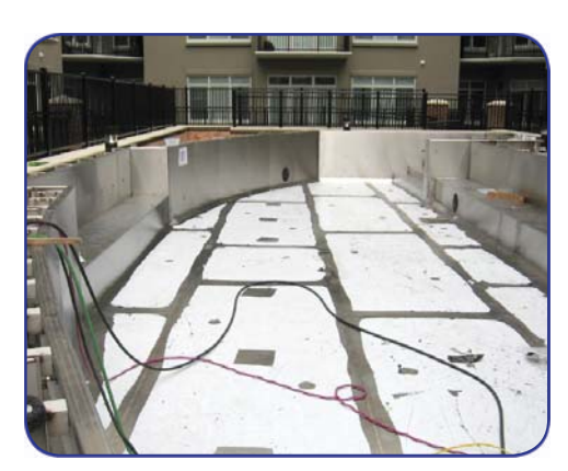
Pool shell, nearly complete