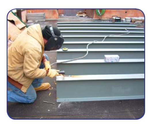
Floor joist installation