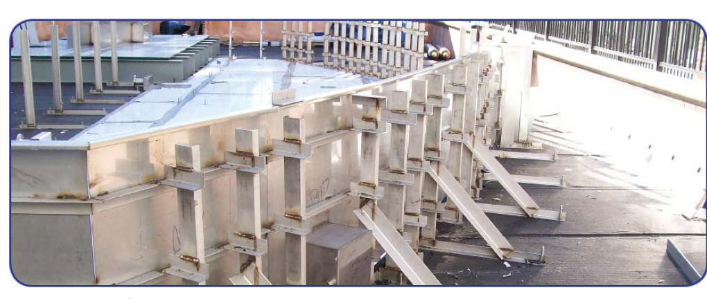
Installation of wall section