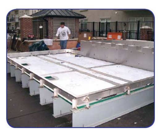
Floor section installation