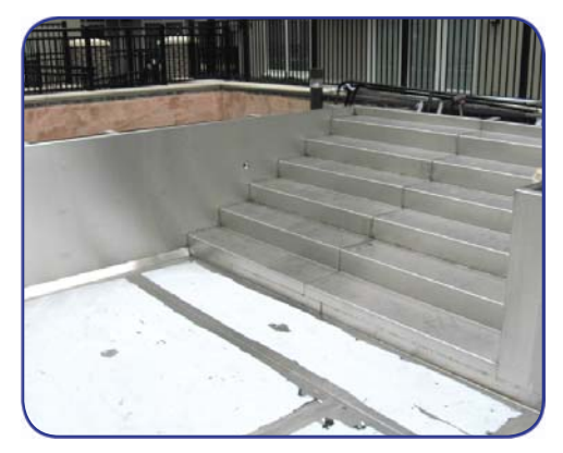
Installation of stair section