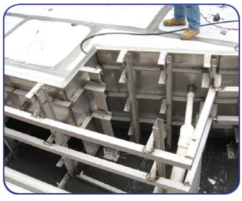
Pool wall corner