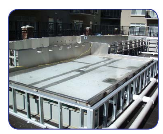
Drain and inlet piping installation