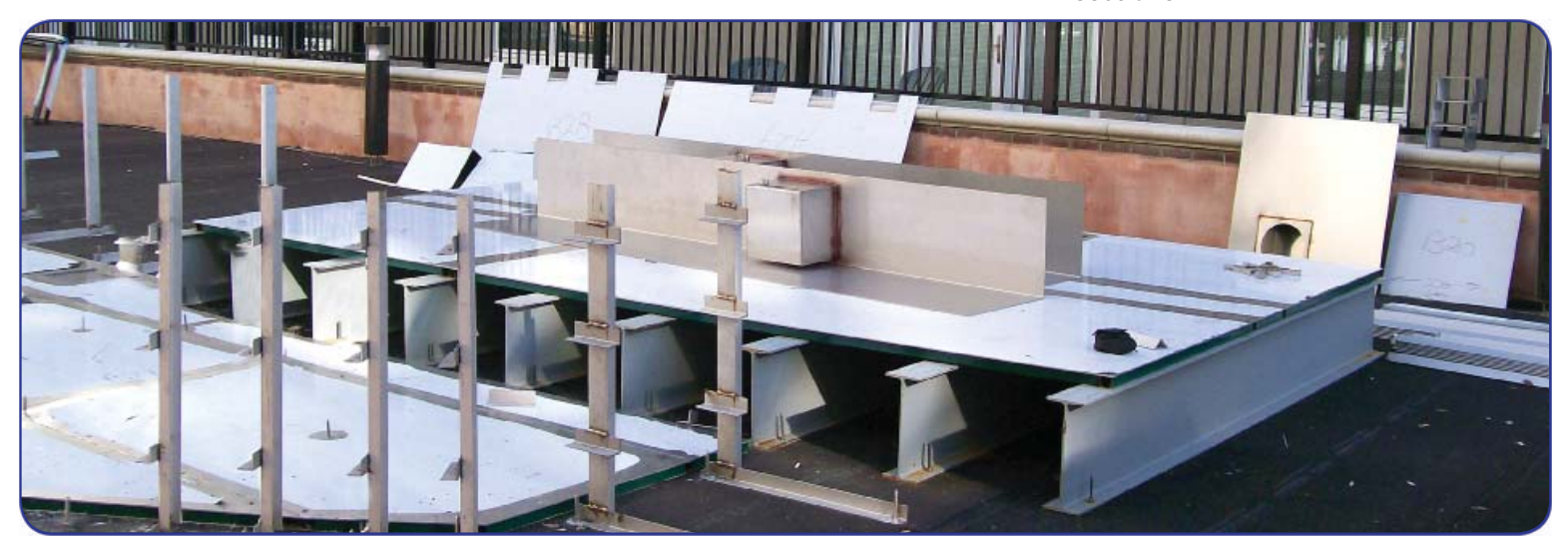
Pool frame, ready for installation of wall sections