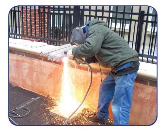
Fabrication of supports for wall sections