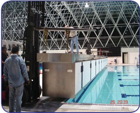
Bulkhead being placed into pool