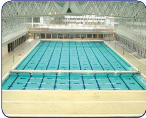
Installed and ready for use