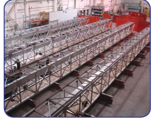
Truss sections under construction