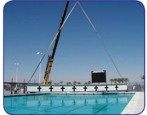
Bulkhead near pool