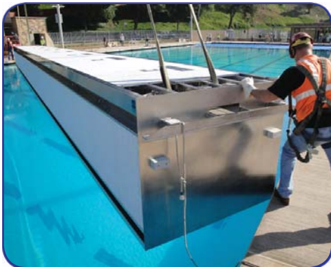
Bulkhead being set into pool