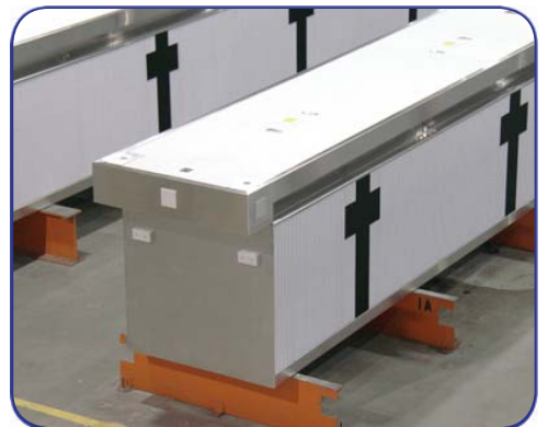
Completed bulkheads ready to ship