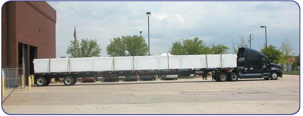
Bulkhead leaving our production facility