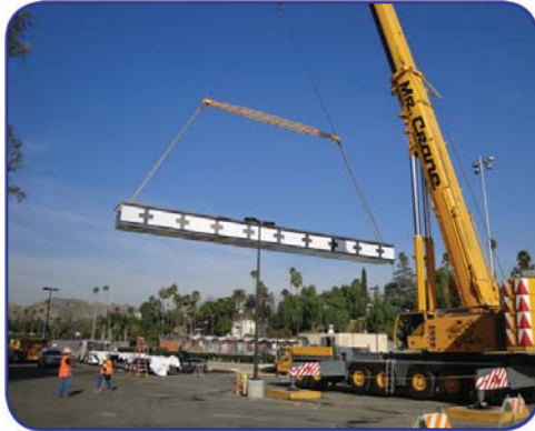
Bulkhead being lifted off the truck