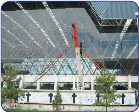
Bulkhead at project site