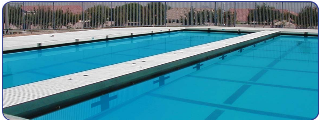
Installed and ready for use