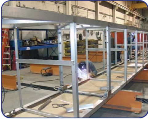
Bulkhead beginning construction