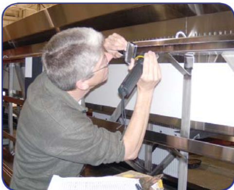
Quality control inspection