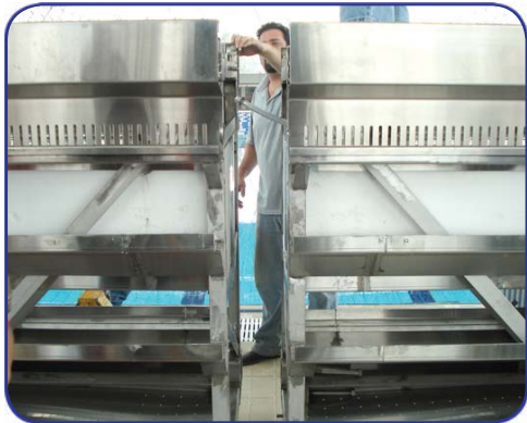
Bulkhead sections being joined together