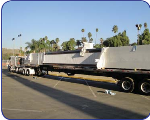
Arriving at project site