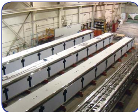
Multiple bulkheads in fabrication