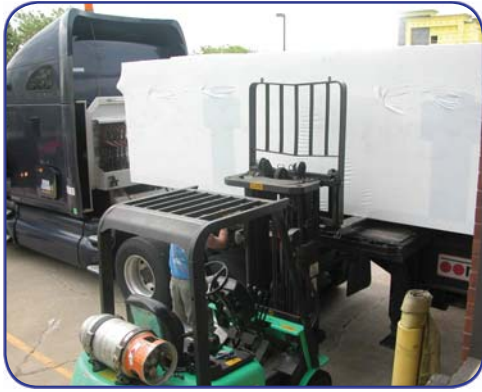
Loading onto semi for shipment