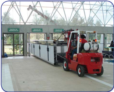
A bulkhead section being brought into building