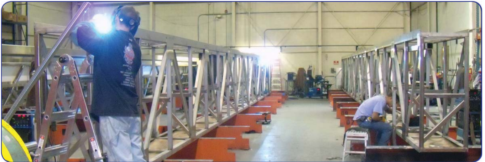
Truss sections under construction