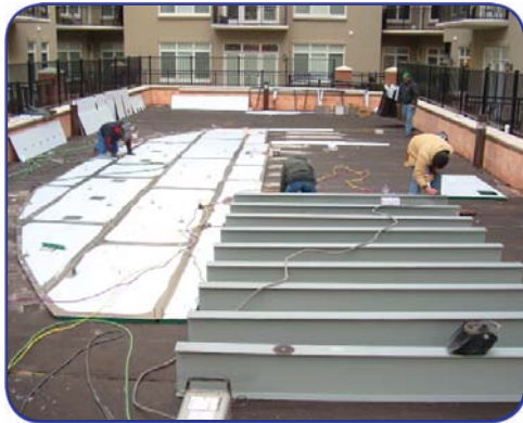
Pool floor under construction