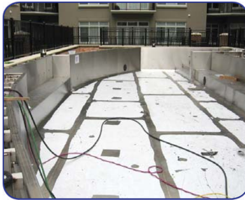
Pool shell, nearly complete