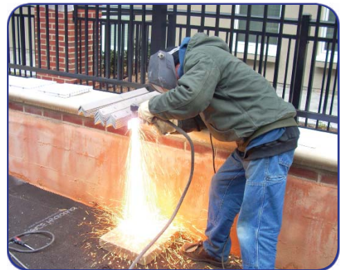
Fabrication of supports for wall sections