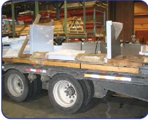
Pool sections are shipped to the project site

Easy to install and virtually maintenance-free, Natare® elevated pools are tailored to each application and installation.