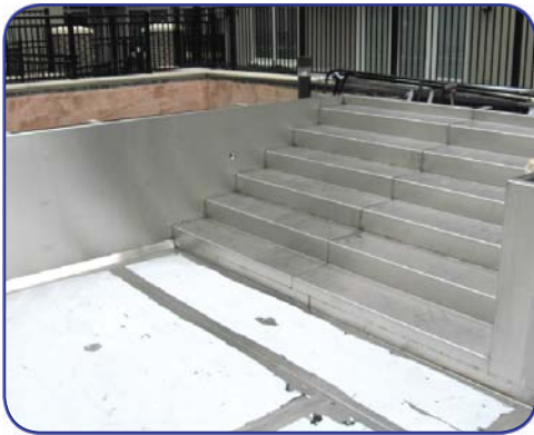
Installation of stair section