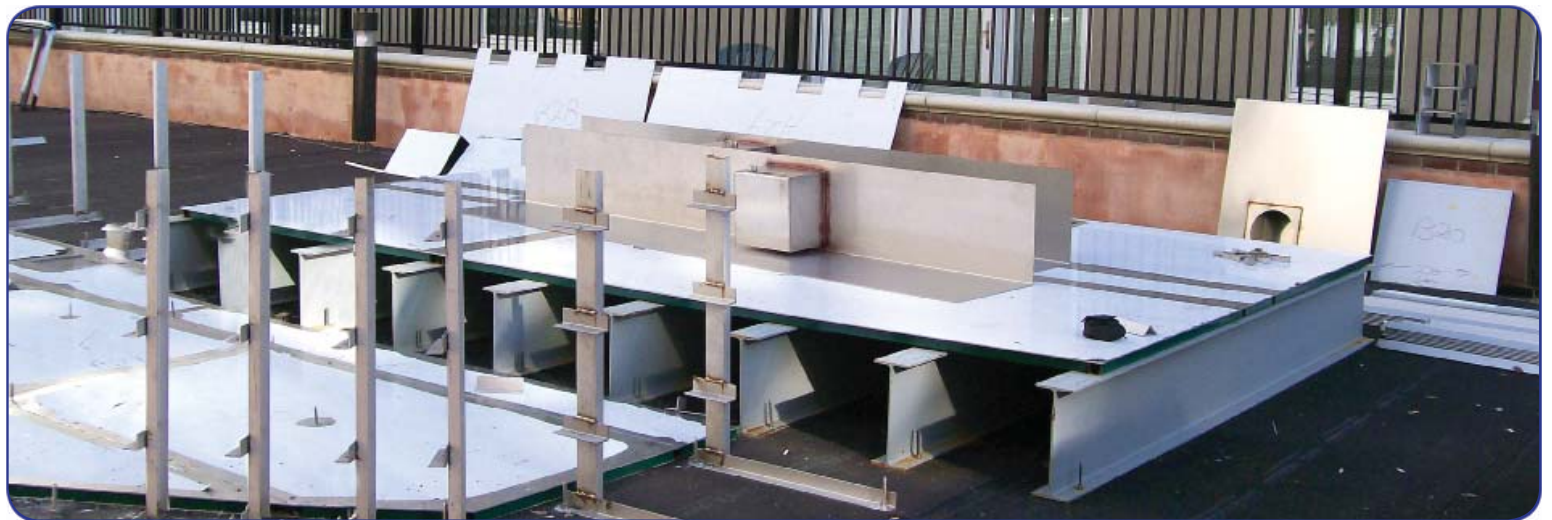
Pool frame, ready for installation of wall sections