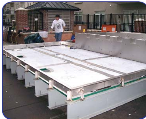
Floor section installation