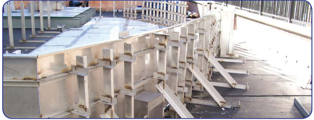
Installation of wall section