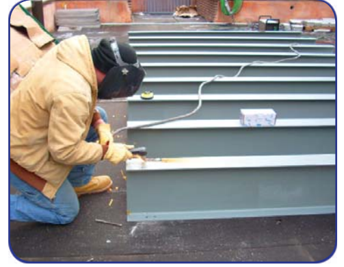
Floor joist installation