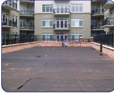
The site is prepared for pool installation