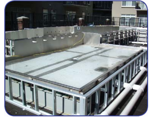
Drain and inlet piping installation