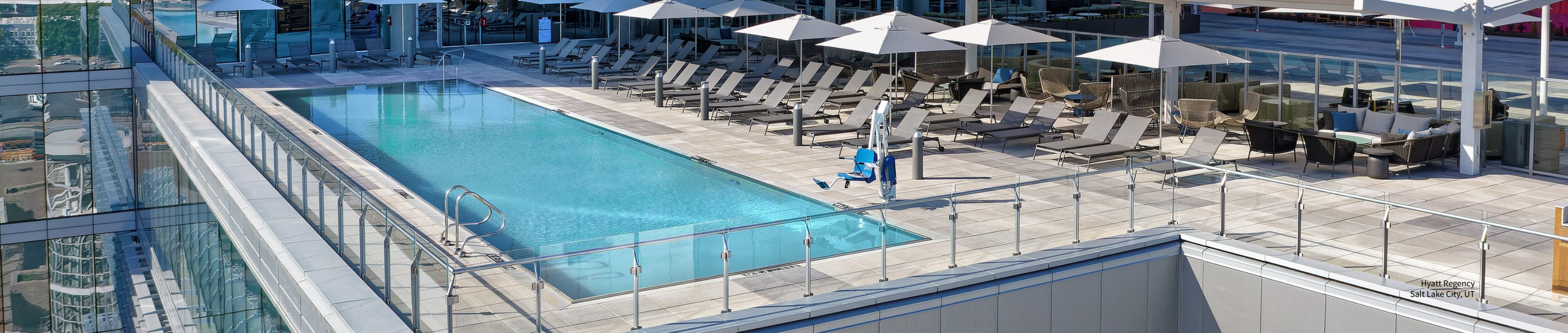
Hyatt Regency Salt Lake City, UT