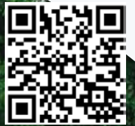
Bloomington Country Club Bloomington, IN